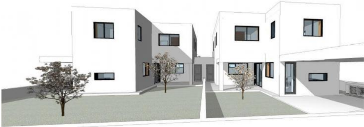
2 3D View 5