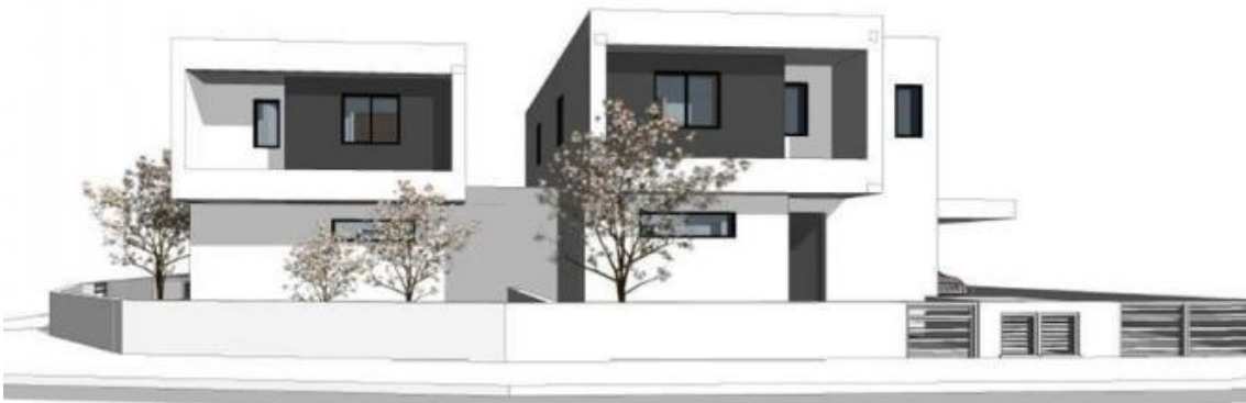
3D View 4