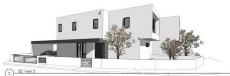
3D View 3