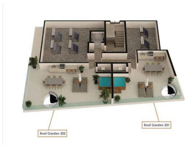
Roof Garden 302