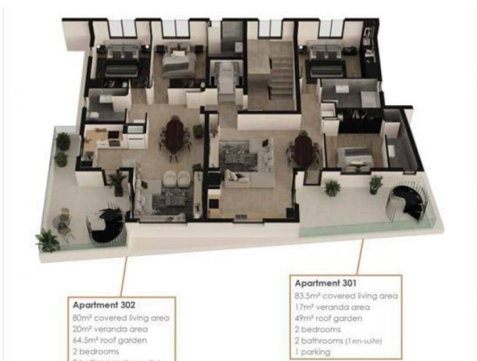
Apartment 302 80m 2 covered living area 20m 2 veranda area 64.5m 2 roof garden 2 bedrooms 2 bathrooms (1 en-suite)